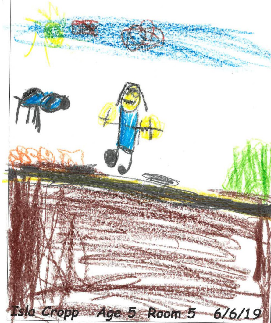
The Bread Tag Story

My dog eats lots of my favourite dolls When he eats them I say "Naughty naughty naughty dog!"